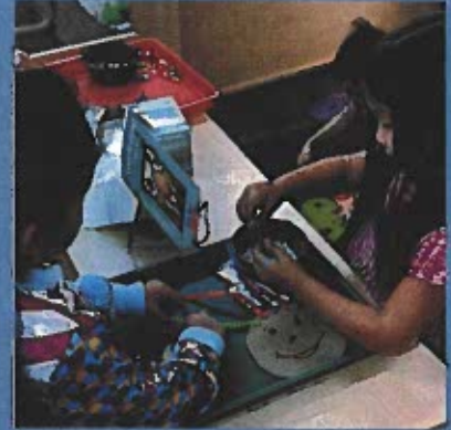
Creative Classroom Enrichment