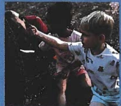
Water & Outdoor Play Exploration